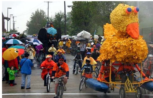
"The Duck" pictured above, won the Best Pit Crew award at the 2005 Baltimore Kinetic Race.

The Trenton Avenue Arts Festival (TAAF), which will take place Saturday, May 19th on Trenton Avenue between Norris and Dauphin Streets from 12-5 p.m., will be the host of a very special first for Philadelphia - the first annual Kensington Kinetic Sculpture Derby!